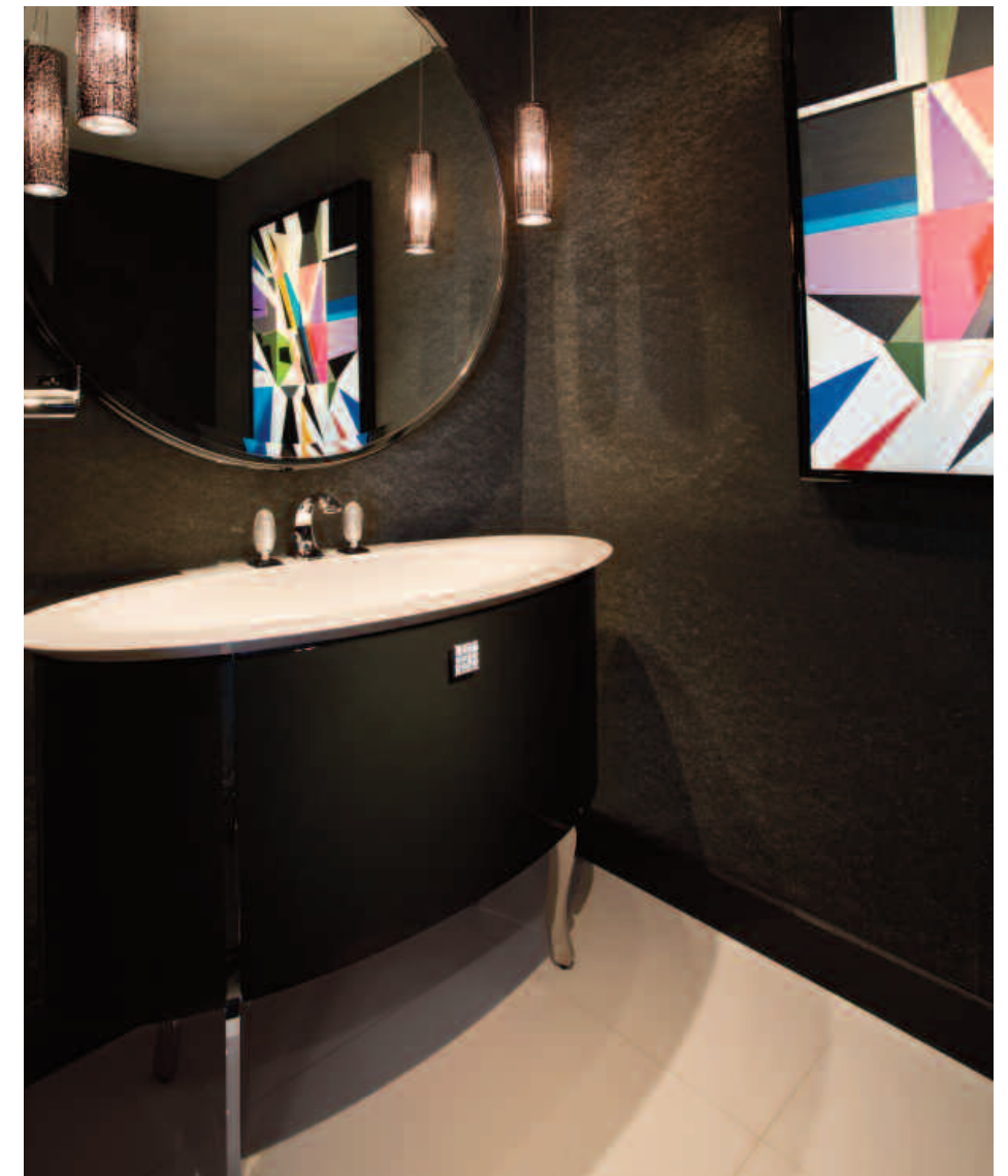
The chic and contemporary powder room combines bold design elements with refined sophistication. The space is defined by its dark, textured walls that create an intimate, dramatic atmosphere, perfectly contrasted by sleek, modern fixtures and pops of color from abstract artwork.