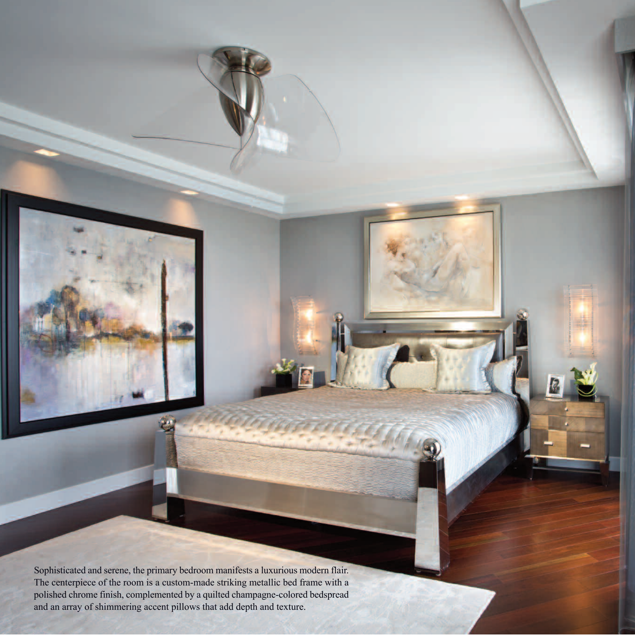
Sophisticated and serene, the primary bedroom manifests a luxurious modern flair. The centerpiece of the room is a custom-made striking metallic bed frame with a polished chrome finish, complemented by a quilted champagne-colored bedspread and an array of shimmering accent pillows that add depth and texture.